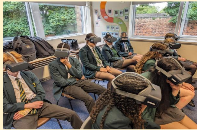
COMINO PROJECT - CREATE DAY 24